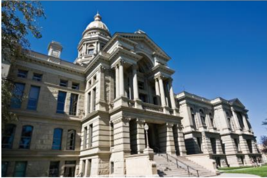
The Wyoming State Capitol in Cheyenne is undergoing a restoration as part of the Wyoming Capitol Square Project.

600 people and is loved for 60-foot windows that offer panoramic views of the lake and mountains. Jackson Hole Airport is also located within the park, just 30 miles south of the lodge.