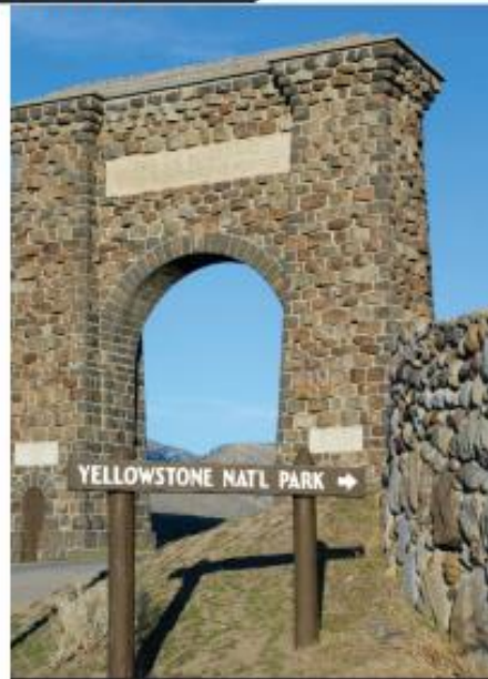
The arch at Yellowstone National Park's north entrance is inscribed: "for the benefit and enjoyment of the people."