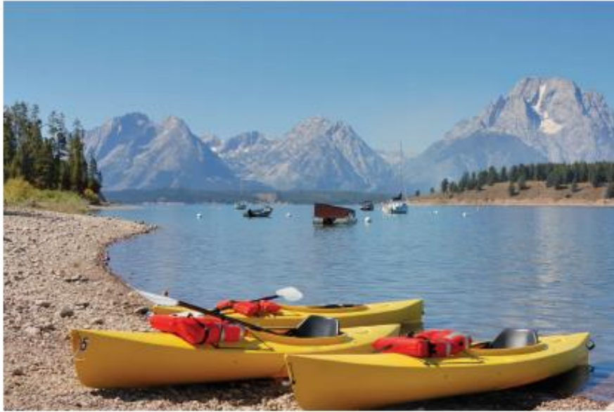
All the activities in Grand Teton National Park are easily accessible to groups meeting at the park's Jackson Lake Lodge.

In recent years, Boise has been topping “best of” lists in magazines like Time , Sunset and Forbes for its active recreational environment, booming cultural scene and economic cost of doing business. The capital city is also a convivial and creative one, and groups might find themselves heading out to try the beverages of the Boise Ale Trail in their spare time or gathering at the new, multimillion-dollar Jack’s Urban Meeting Place (JUMP) downtown, which offers features that include a variety of studios—including one for cooking and another for multimedia projects—as well as meeting rooms and green outdoor spaces.